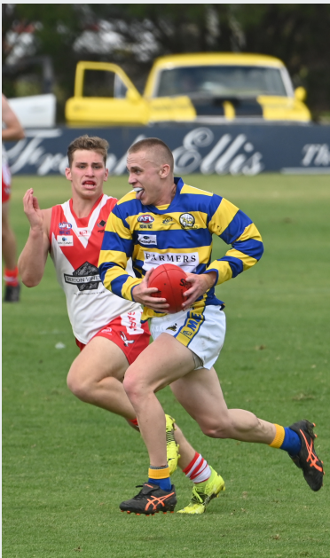
Round 1 2022 RFL action